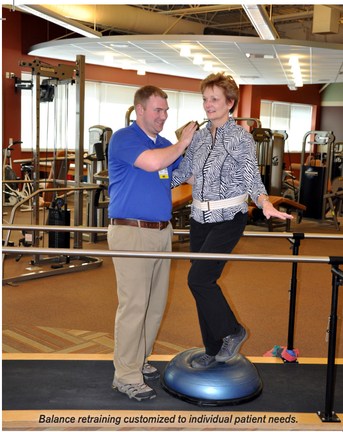
Balance retraining customized to individual patient needs.